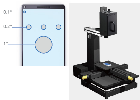
<Example measurement diameters for 500 mm objective distance>

The minimum measurement diameter is \phi 0.5 mm, while the use of an optional close-up lens enables measurement of \phi 0.1 mm. This supports the measurement of light sources in tiny areas, such as instrument panels for vehicles and aircraft, as well as indicators for car audio systems, in addition to general displays.