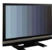
Earlier model display: 0.01 to 500 cd/m 2

Recently, demands for higher-quality images and video have been growing among smartphone users, due partly to dramatic increases in communication speed. In response, manufacturers are accelerating the development of higher-resolution displays with improved contrast ratio and color reproduction, such as HDR displays. As a result, manufacturers of such displays require a color analyzer with a wider measurement range, from extremely low to high luminance.