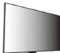
HDR display: 0.001 to more than 1,000 cd/m 2

With its new sensor circuits, the CA-410 achieves an accuracy-guaranteed luminance range from 0.001 to 5,000 cd/m 2 , 25 times wider than the previous model. This increased measurement range will help manufacturers to control and improve the quality of high-resolution displays, enabling smartphones and TVs to show higher-quality images and videos.